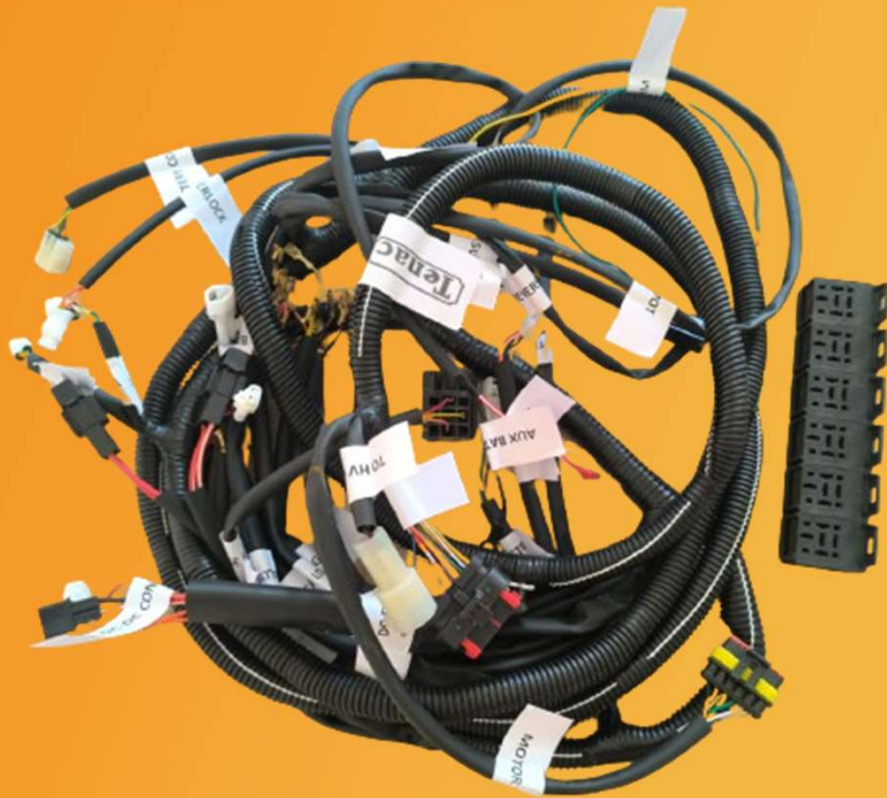
L-5 WIRE HARNESS ASSEMBLY