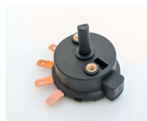
MIXER GRINDER SWITCH (ROTARY TYPE)

FOUR STEP FR GRADE 100K CYCLE TESTED 250 V AC