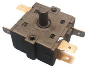
WATER HEATER SWITCH (ROTARY)

THREE STEP FR GRADE 100K CYCLE TESTED 250 V AC