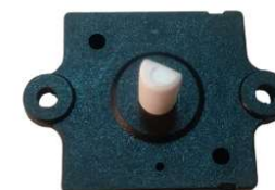
MICRO SWITCH (AIR COOLER)

THREE STEP FR GRADE, ROHS COMPLIANCE 100K CYCLE TESTED 250 V AC