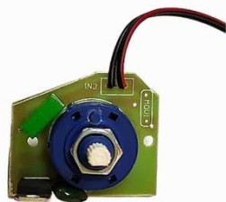
COOLER PCB SWITCH (AIR COOLER)

FIVE STEP (RESISTANCE VARIABLE) FR GRADE, ROHS COMPLIANCE 100K CYCLE TESTED 250 V AC