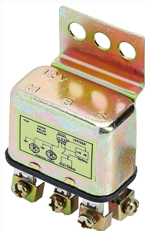
ER401006 HORN CUTOUT (RELAY) PMP TYPE 12 / 24 VOLTS.