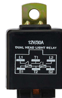
ER401022 ELECTRONIC HEADLAMP RELAY ALL 12/24 VOLTS. VEHICLES WITH COMPLETE WIRING