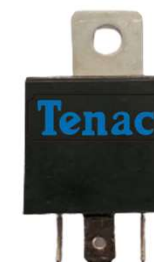
ER401035 ELECTRONIC RELAY (WATERPROOF) 12/24 VOLTS.; 20 AMP. 4 PINS