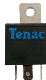
ER401034 ELECTRONIC RELAY (WATERPROOF) 12/24 VOLTS.; 10 AMP. 3 PINS