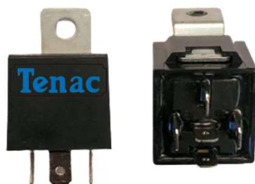
ER401033 ELECTRONIC RELAY (WATERPROOF) 12/24 VOLTS.; 20 AMP. 5 PINS