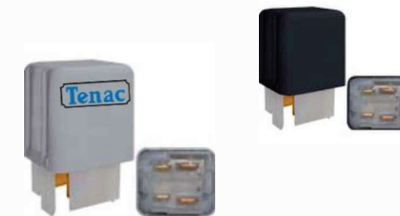
ER401031 RELAY HEAVY DUTY 12V DC